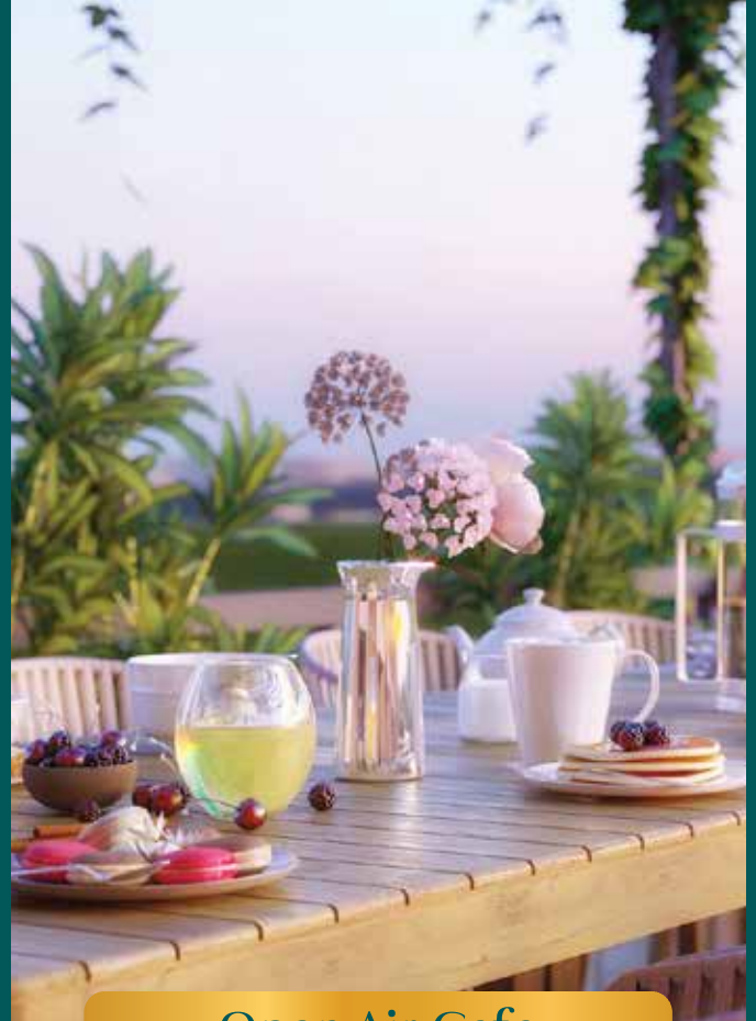
Open Air Cafe