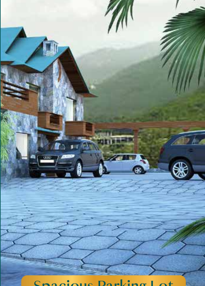
Spacious Parking Lot